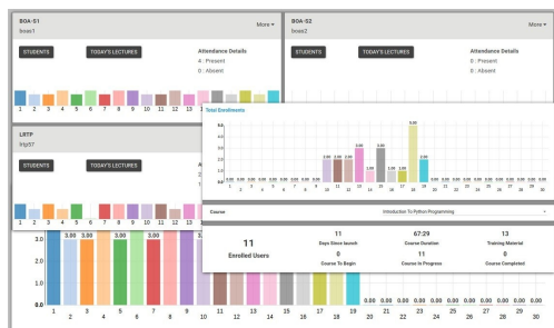
Management Dashboards & KPI